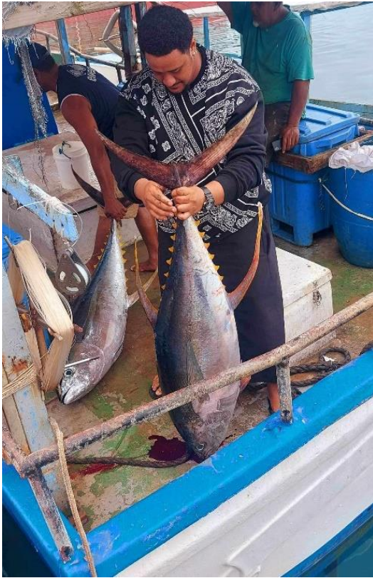
TAILS data collection in Vava'u