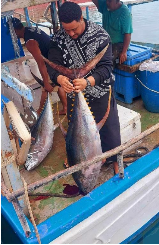
TAILS data collection in Vava'u