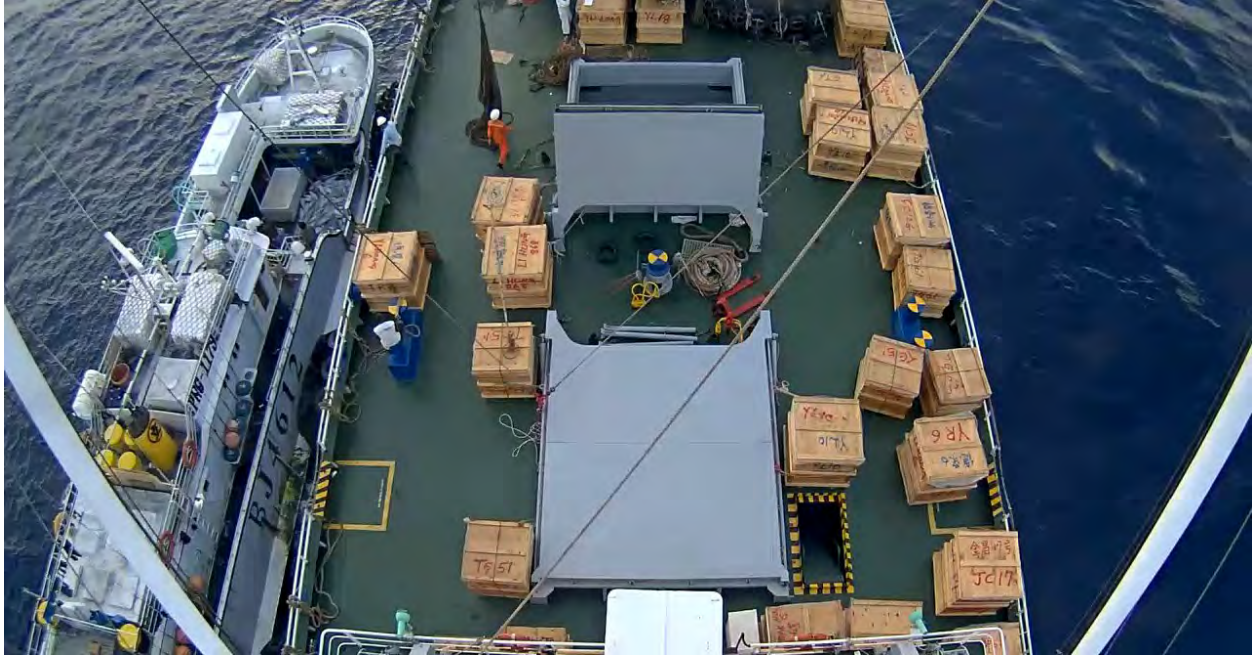
Figure 2. Image of a Tunago company tuna longline vessel transshipping to the SHC102