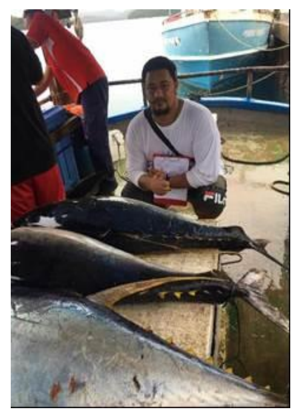
TAILS Data collection in Ha'apai